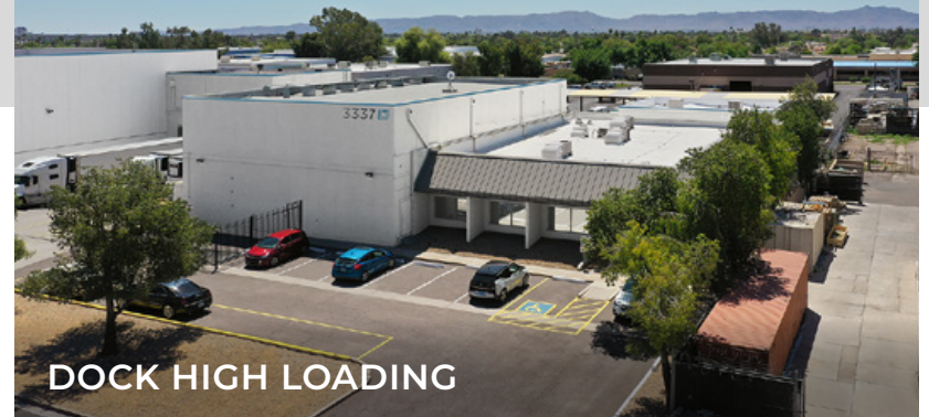
DOCK HIGH LOADING